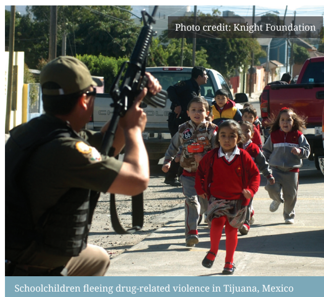
Schoolchildren fleeing drug-related violence in Tijuana, Mexico