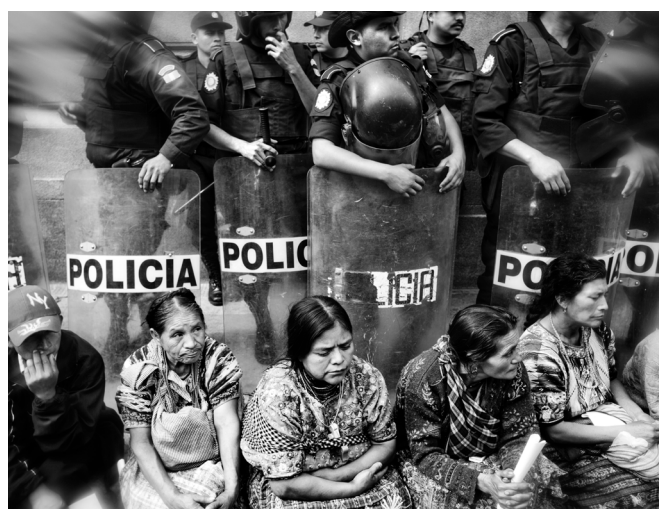
Countless children have been deprived of parental support as a result of incarceration for drug offences

Children of incarcerated parents are at greater risk of suffering from depression and becoming aggressive or withdrawn, 40 and boys with incarcerated fathers have substantially worse social and other non-cognitive skills at school entry 41