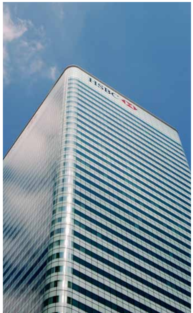
Major financial institutions have been complicit in the illicit drug trade

The problem, however, appears to be a political rather than practical one. In some cases, political constraints or legal mandates actively prevent exploring alternatives. (56) When those responsible for developing and implementing drug policies are unable to assess options that at least have the potential to deliver better economic outcomes (whether one agrees with them or not), it is clear that we are operating in a political arena shaped by something other than evidence of cost-effectiveness.