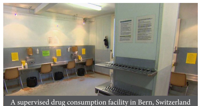
A supervised drug consumption facility in Bern, Switzerland

The first Swiss pilot HAT clinics opened in 1994. In 1997, the federal government approved a large-scale expansion, aimed at 15% of the nation’s estimated 30,000 heroin users, specifically long-term users who had not succeeded with other treatments. Other countries followed suit, with the UK opening three pilot NHS supervised injecting clinics (London, Brighton and Darlington) in 2009 - the Randomised Injectable Opiate Treatment Trial (RIOTT) 4 - extended to 2016 after proving successful. 5